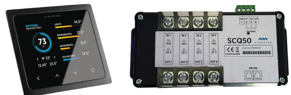
*Optional Simarine Pico Monitor and SCQ50 Shunt