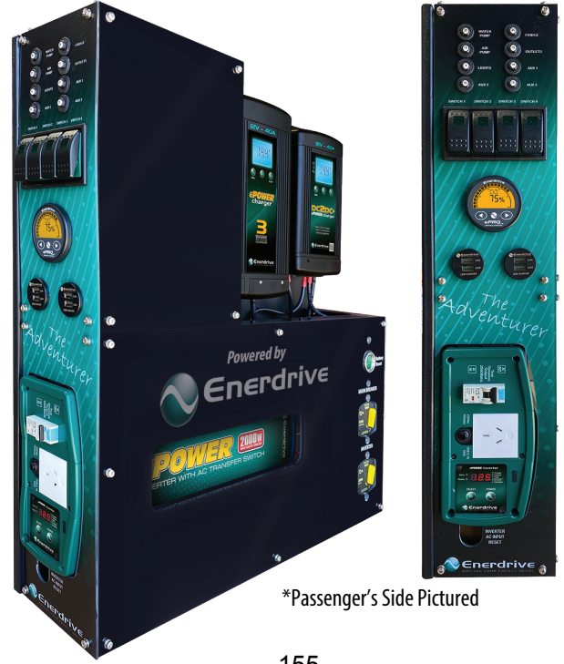
*Passenger's Side Pictured