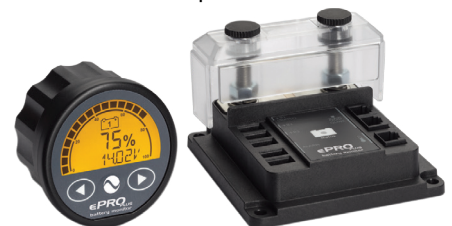
*Standard ePRO Plus Battery Monitor