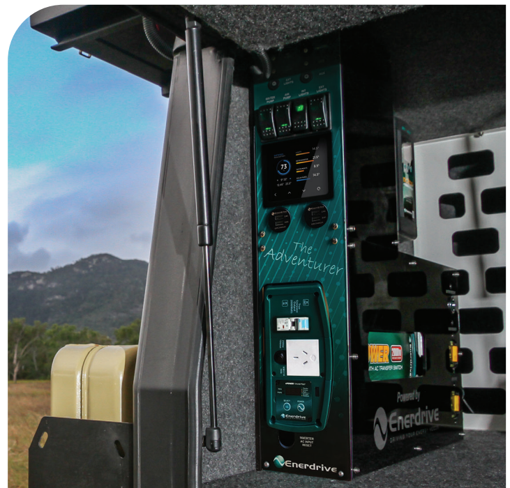
*Passenger side, Simarine with x2 USB Outlets pictured